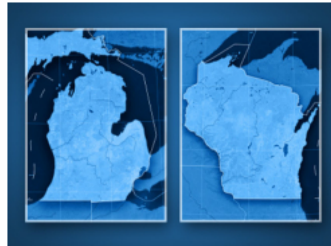
Michigan and Wisconsin states map